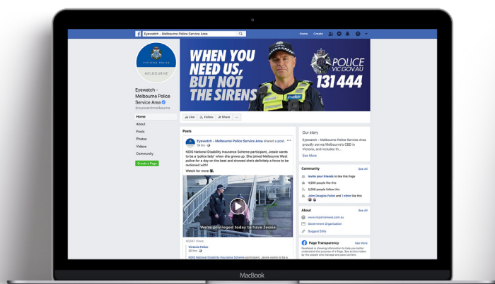
Victoria Police Eyewatch