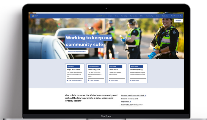
Victoria Police website