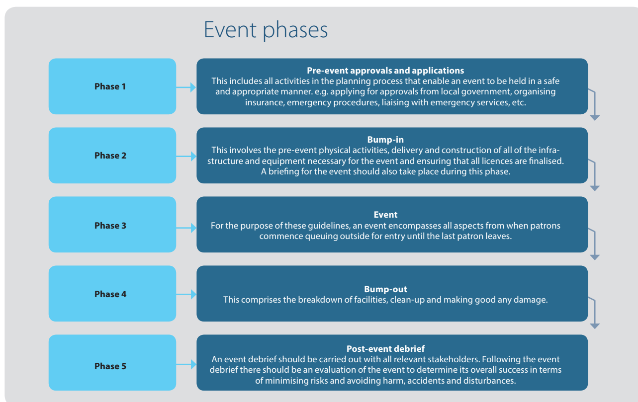
▼ Diagram 1 Five phases of an event

A summary table of key roles and responsibilities during each event phase can be found in Appendix 2 .